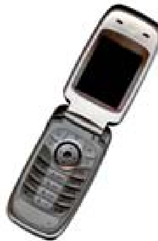
Fig. 2. Example of an unacceptable low-resolution image