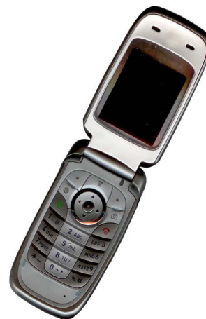
Fig. 3. Example of an image with acceptable resolution